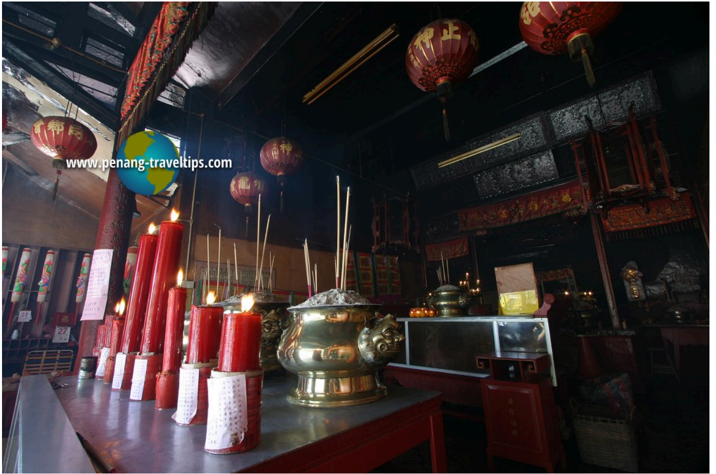
Prayer hall of the Tanjong Tokong Tua Pek Kong Temple (27 November 2005)