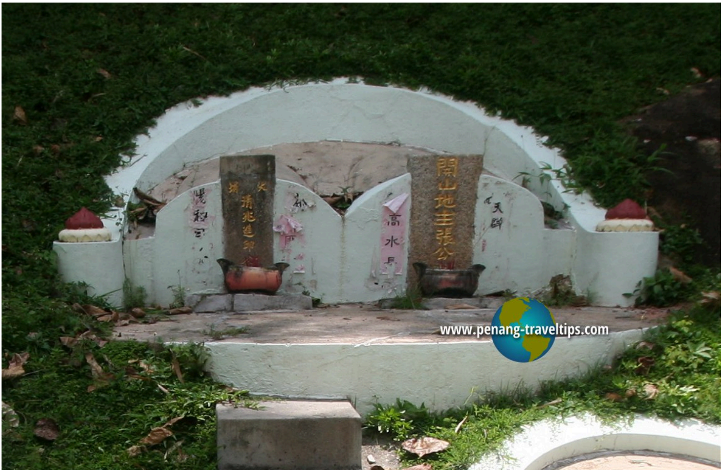
Zhang Li's grave is probably the one on the right (14 September 2012)

© Timothy Tye - Please get my permission before using my photo