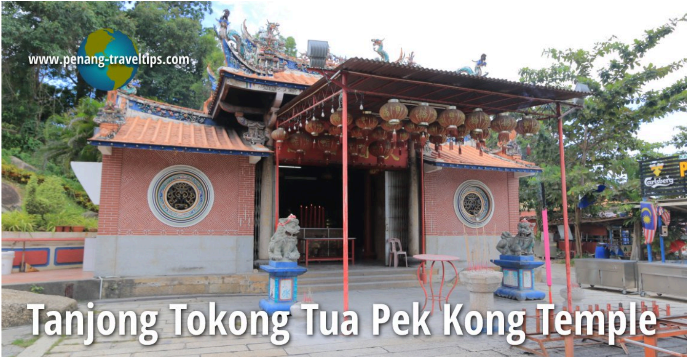
Tanjong Tokong Tua Pek Kong Temple (14 November 2017)

© Timothy Tye - Please get my permission before using my photo