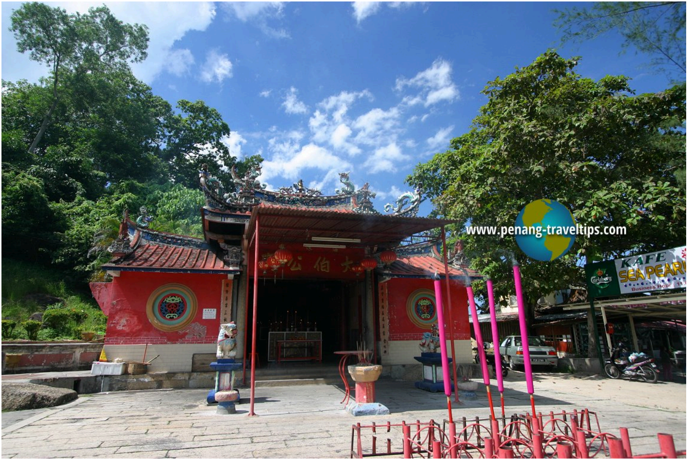
Tanjong Tokong Tua Pek Kong Temple (27 November 2005)