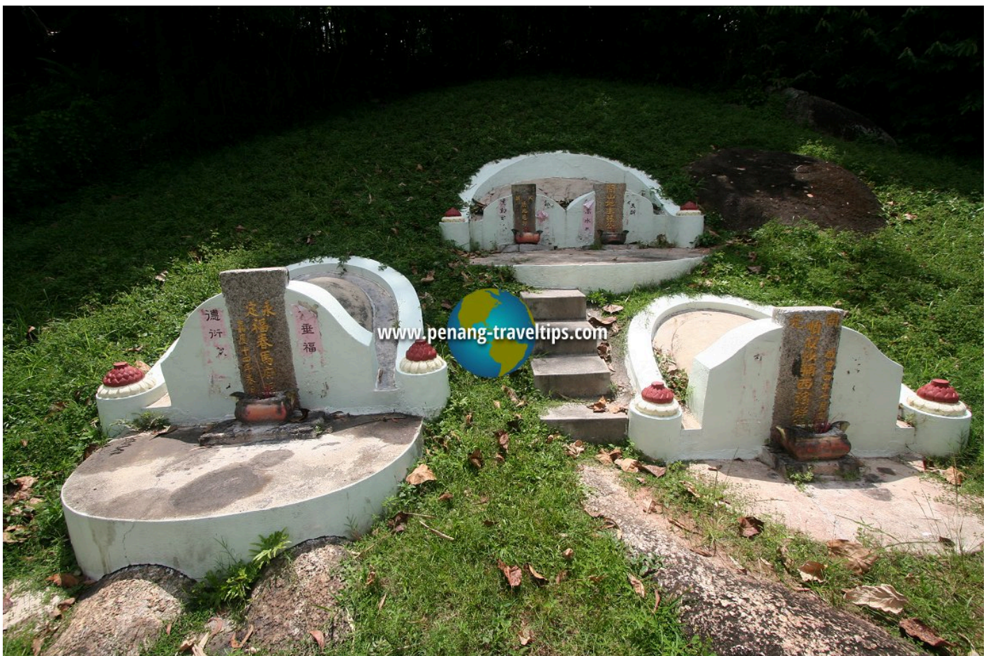
Ancient graves. The one at top right is probably the one of Zhang Li (14 September 2008)