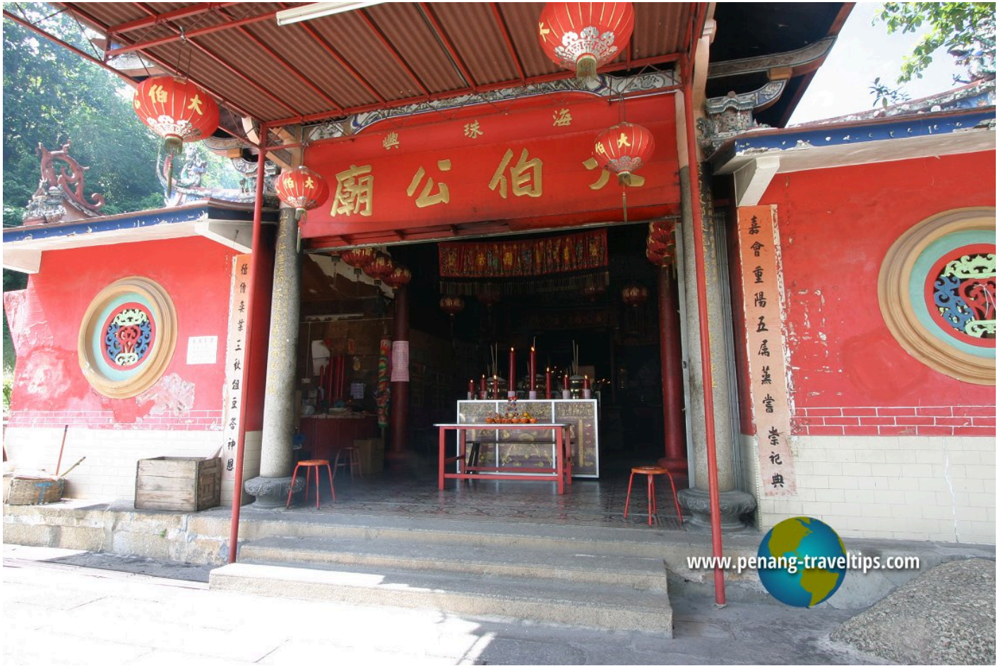
The front porch of the Tanjong Tokong Tua Pek Kong Temple (27 November 2005)

© Timothy Tye - Please get my permission before using my photo