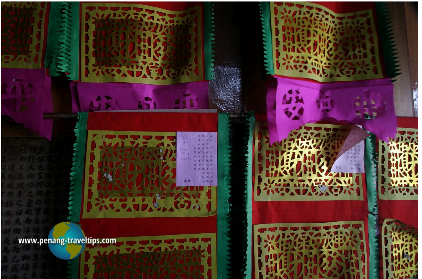
Prayers of the worshippers are hung on the wall of the temple. (27 November 2005)