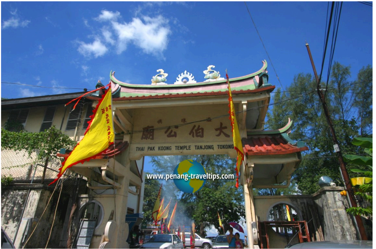
Entrance archway to the Tanjong Tokong Tua Pek Kong Temple (27 November 2005)