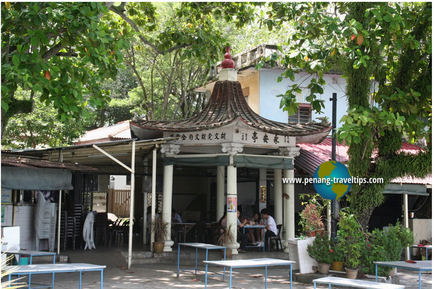
This seaside pavilion near the Tua Pek Kong Temple was erected in the 1950s by philanthropist Aw Boon Haw. It is now used as part of the Sea Pearl Lagoon Cafe. (14 September 2008)