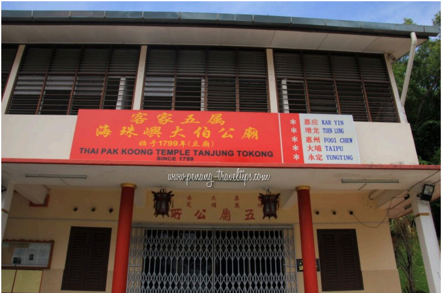
The temple administrative building (16 December 2012)

To reach the Tanjong Tokong Tua Pek Kong Temple, take Rapid Penang ( https://www.penang-traveltips.com/rapid-penang-bus-routes.htm ) bus 101 , 103 , 104 from Weld Quay. Get off the bus near the pedestrian bridge at Tanjong Tokong (ask a local for help). Cross the road and then go down a off-shoot road. You can see low-cost flats to your right. Walk along the road until you reach the temple which is located within its own compound by the seaside.