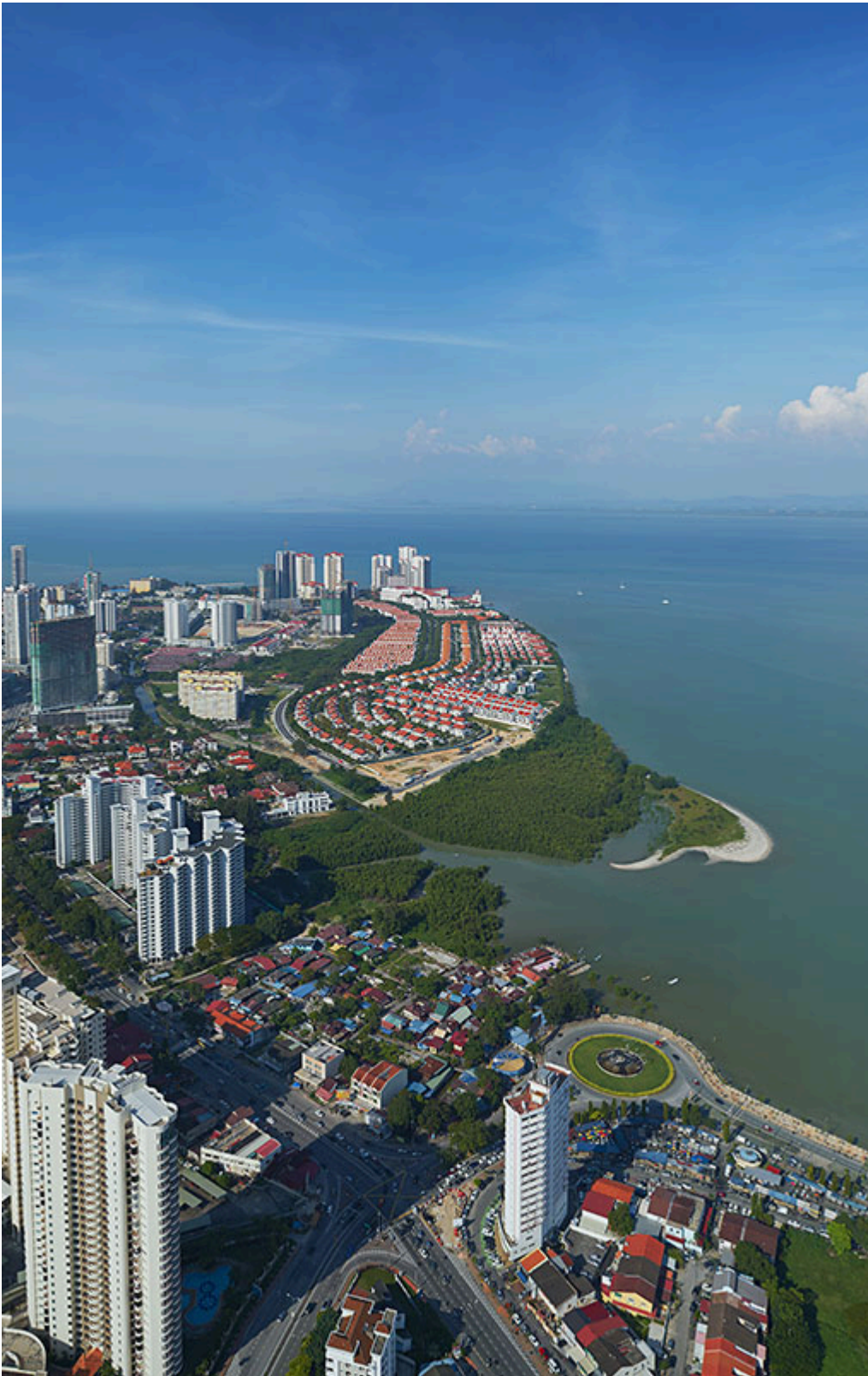
(Left and centre) Aerial images taken in 1996 of Seri Tanjung Pinang Phase 1; (Right) Aerial photo of Seri Tanjung Pinang Phase 1 in 2015

In 2003, Eastern & Oriental Berhad (E&O) through its subsidiary Tanjung Pinang Development (TPD), assumed the rights, obligations and liabilities of the former concessionaire. In reviving the abandoned site, the development mix was reconfigured in favour of residential homes instead of the original focus on high density commercial properties. Despite the substantial initial acquisition and investment cost during still testing economic conditions, E&O completed the reclamation of Seri Tanjung Pinang Phase 1 (STP1), and held its maiden launch of terraced homes in 2005, with handover to purchasers in 2006.