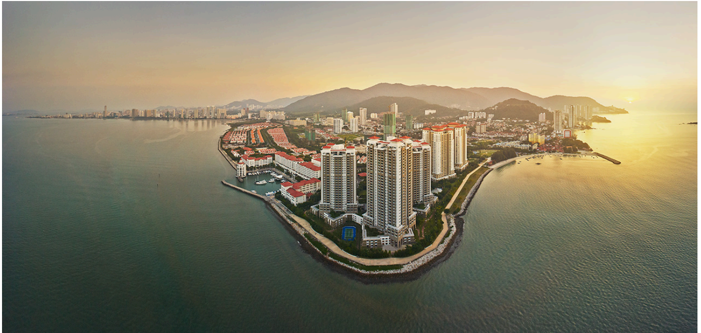
Actual photo of Seri Tanjung Pinang Phase 1 today

In almost a decade, the transformation has provided an innovative range of new homes and amenities, with Penangites forming the majority of residents at STP1, followed gradually by a regional and international audience of purchasers.